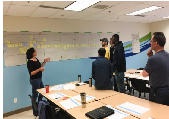
Fig. 3 - Development Project

The following are some of the key results achieved through the six projects: