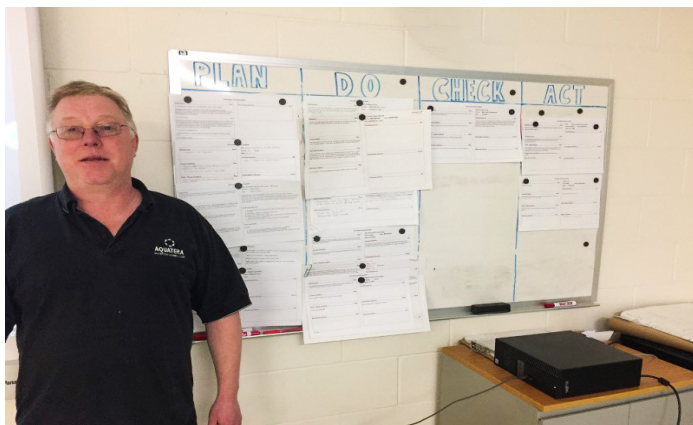
Fig 5. - Plan, Do, Check, Act (PDCA)

Annual CEO strategic objectives were developed and cascaded across all work teams through the use of Hoshin Kanri.