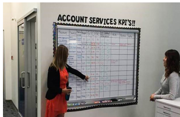
Fig 7. - KPI Board