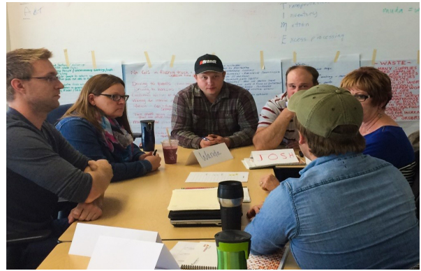
Fig. 1 -Yellow Belt Training

Aquatera subsequently introduced Yellow Belt training for all staff members, and this proved to be the catalyst for a culture shift that embraced Lean.