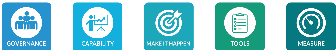
Fig. 2 - Aquatera Way Framework

A framework was required to ensure that everybody in the organization was working on the right thing and involved in making the business better. The creation of the Aquatera Way framework requires a step-by-step process that evolves over time. The Aquatera Way framework presented in this paper was developed to support each individual journey in Lean and consists of six core pillars.