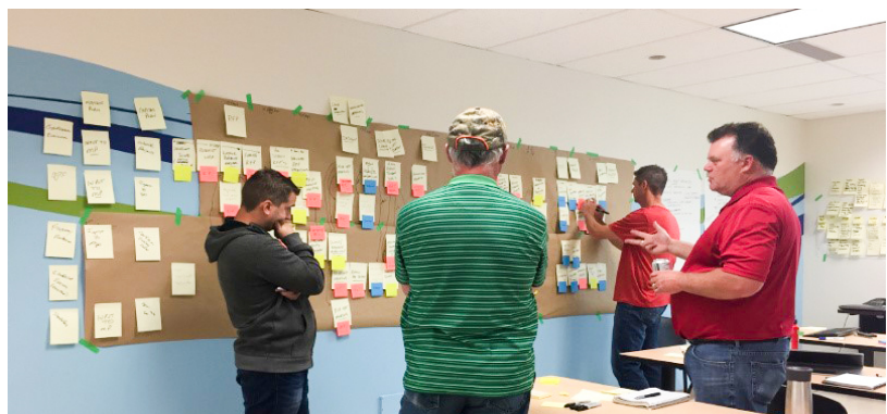
Fig. 4 - Value Stream Mapping Tool

In the spirit of continuous improvement, Aquatera drove constantly for the selection and use of best practice tools. Leading Edge Group worked with Aquatera to provide best practice tools and resources that were made available for Lean initiatives.